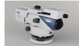
Optical Micrometer OM5 (B20)