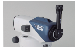
Diagonal Eyepiece DE16 (B20)