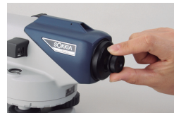
40x Eyepiece EL5 (B20)